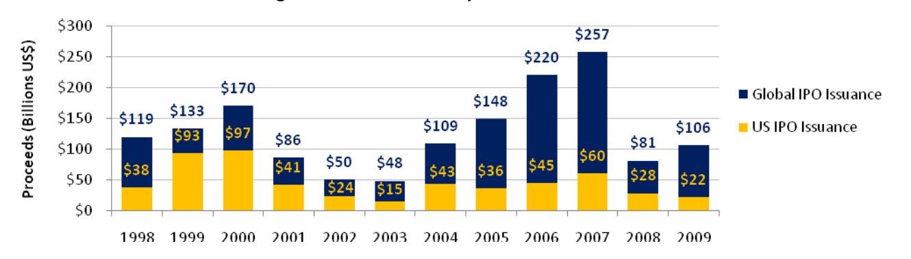
Exhibit 1 Global Investors Purchase an Average $130 Billion IPOs per Year U.S. Investors Purchase an Average of $45 Billion IPOs per Year

Includes IPOs with deal size of US$100mm or greater.